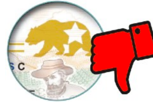
Real ID License: Bear with Star