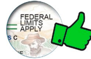
FNC License: No Star; Federal Limits Apply text